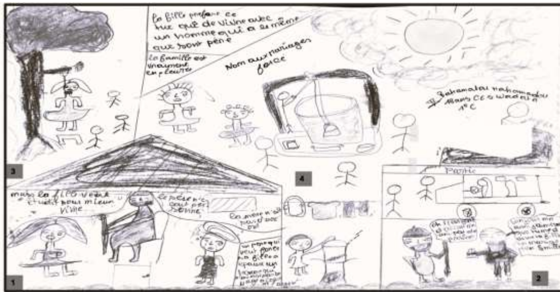
Figure 2: Rich picture diagram from adolescents in Niger depicting a father who forces his daughter to marry an older man

MSRHR. Rich pictures enabled adolescents to share their perspectives on sensitive topics such as suicide, drug use, child marriage, and abortion and to highlight connections between SRHR and MH issues. Adolescent rich pictures also illuminated the inter-relationships between gendered power relations and poor AMSRHR outcomes, particularly for girls. We provide one example of a rich picture from Niger in Figure 2